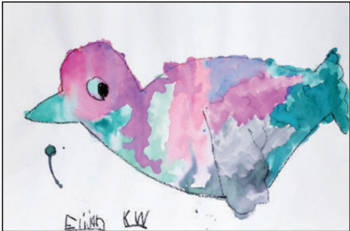
K-Grade 2 — 1st place — Elijah Pickerill