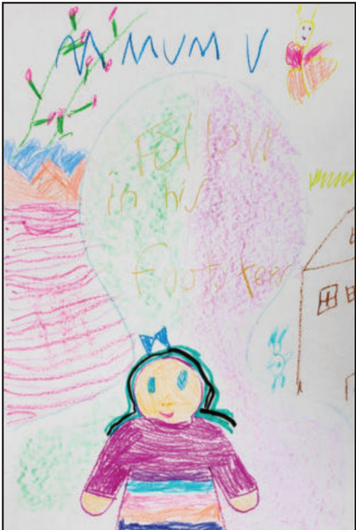
K-Grade 2 — 3rd place — Elle McGowan