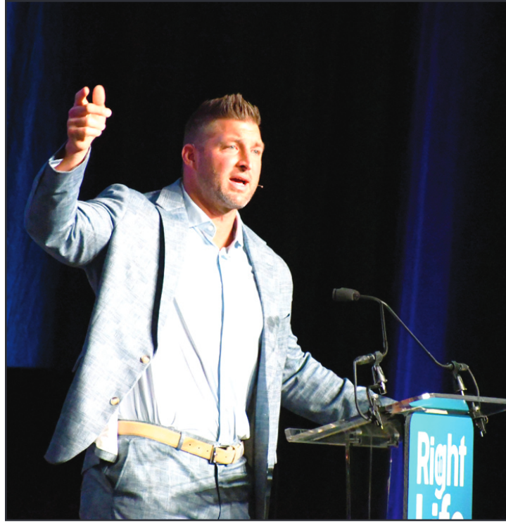
Former Heisman Trophy winner Tim Tebow speaks to 2,500 attendees at the annual Southwest Indiana Right to Life Banquet.