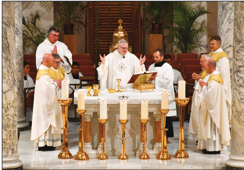
The Message