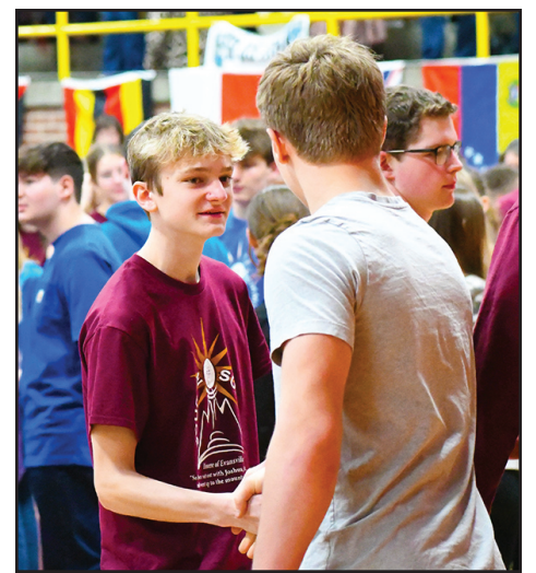
Source + Summit attendees shake hands during Mass March 15 at Mater Dei High School.