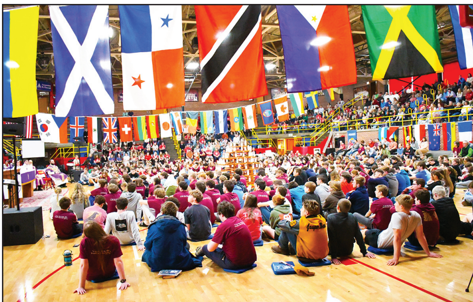
Source + Summit attendees and their families fill Mater Dei High School for Mass.