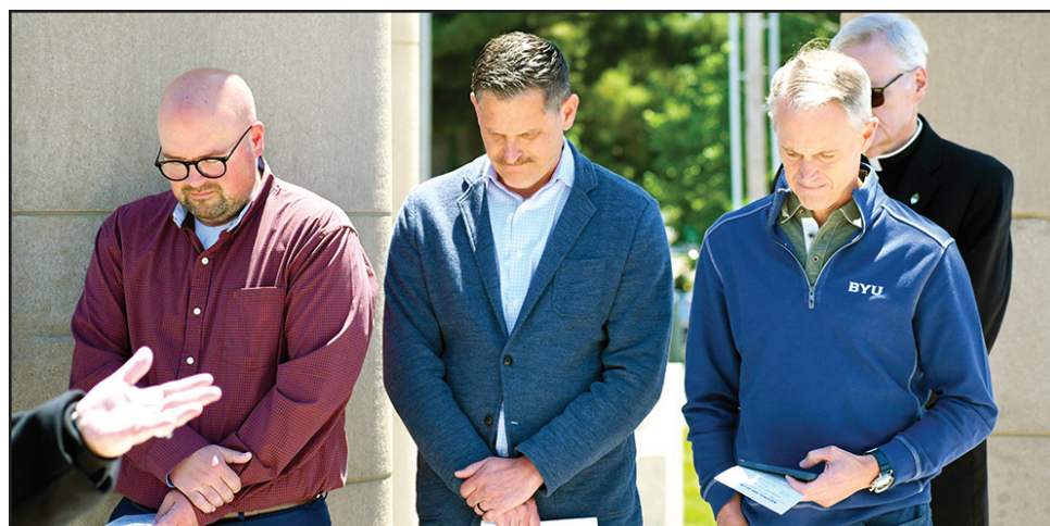
See PRAYER , page 5 Faith leaders participate in prayer during National Day of Prayer.

The proclamation declared May 7 as National Day of Prayer in the City of